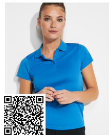
MONZHA WOMAN PO0410