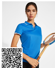
TAMIL WOMAN PO0409