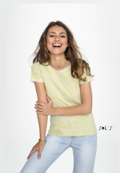
MILES WOMEN 01399