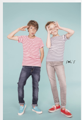
MILES KIDS 01400