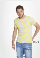
MILES MEN 01398