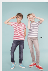
MILES KIDS 01400