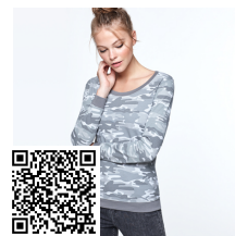
MALONE WOMAN CF1032